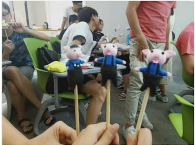
It is not easy to pinch a piggy!