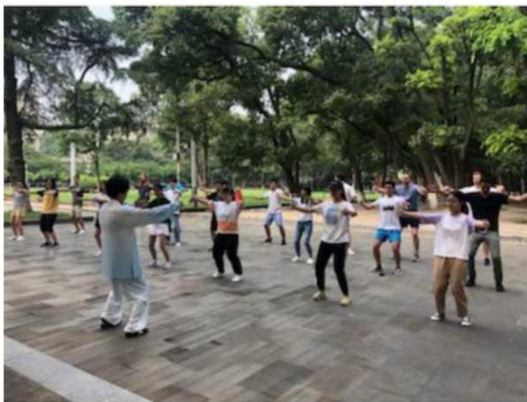
Take a look at our laiji!

We have also arranged various Chinese culture lectures, such as laiji, Paper-cutting, Chinese Painting, Calligraphy or brush Writing, Pinching Clay. All students enjoyed experiencing the profound Chinese culture.