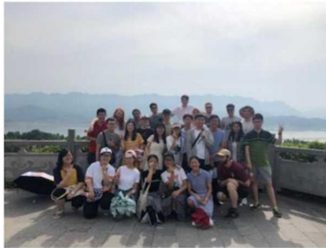
Guess! Where are we?

During the summer camp, students carried out some trips. They went to the Three Gorges Dam to experience the shock of the Chinese project. In Yichang, we indulged in the beautiful scenery and felt the ethnic customs of the lujia minority; We also enjoyed the beautiful scenery in the Chexi Scenic Area, and experienced the traditional textile fabric production and the ancient Chinese waterwheel. The East Lake Greenway demonstrated the charm and attraction of Wuhan. Although we have different nationalities and different living styles, everyone felt the enthusiasm of the people in Hubei and experienced the characteristic Chinese culture.