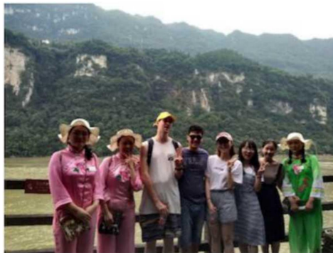
Cotorful custom and cultural experienc