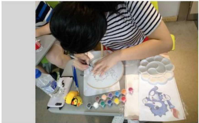
Let's draw a picture of 7th Military World Games mascot together!