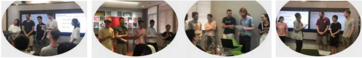
Different groups interacted for the first time

After the lectures, students were divided into 5 groups according to their interests. Each group chose one