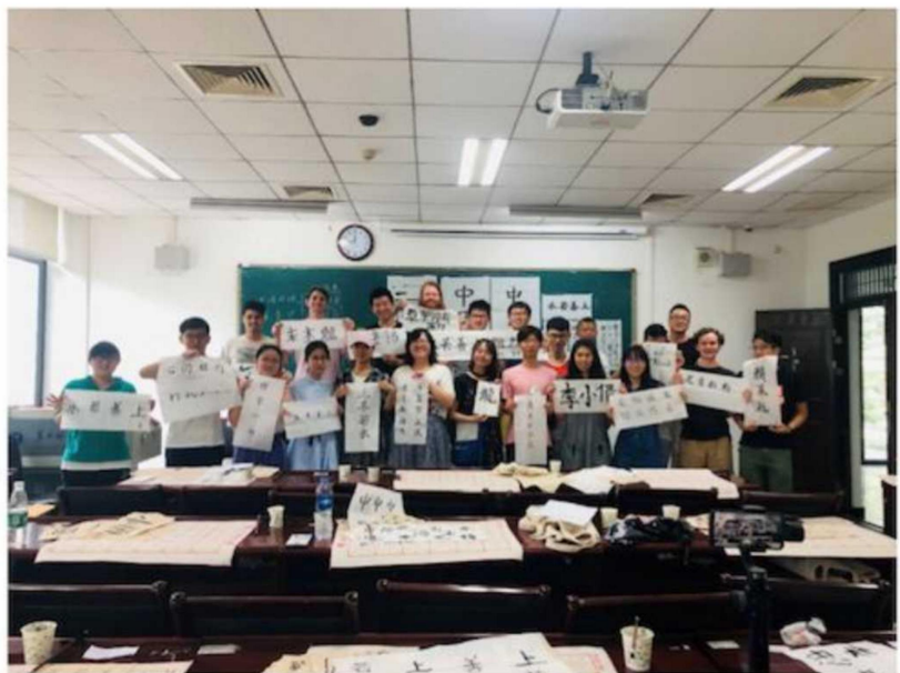
The teacher is teaching us to write Chinese Characters