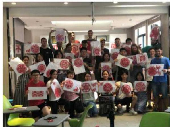
Our nice Paper-cutting works!